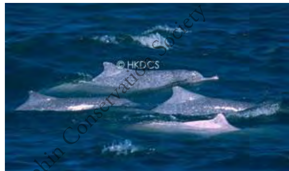
Chinese white dolphins in Taiwan look similar to those in HK, but bear more spots.

Yang's group began surveying the population of humpbacked dolphins along the west coast of Taiwan in 2002. A total of 49 dolphins were recorded by the group, most of which were spotted within 5km of the coastline between Miaoli and Chiayi counties.