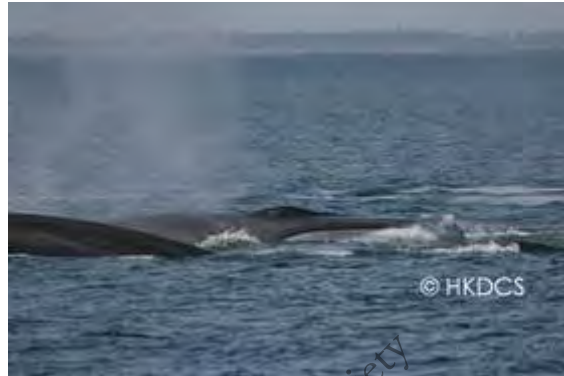
Fin whale – one of the species residing in the Strait of Gibraltar

Areas used by fin, sperm, Cuvier's beaked and killer whales as well as bottlenose and common dolphins and harbor porpoises for feeding, breeding and rearing young are proposed for protection from encroaching industry and pollution.