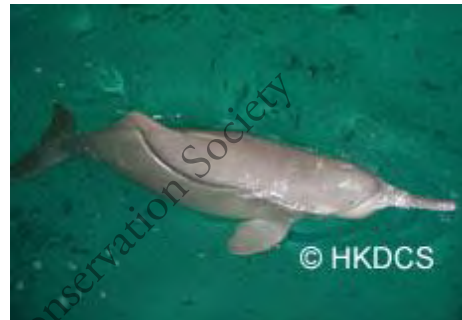
Qi Qi - a captive baiji (died in 2002)

The last such expedition, in 1997, located 13 of the world's rarest dolphins, which lives only in China's longest river, the Yangtze, Xinhua news agency said Saturday. The baiji is considered to be more endangered than the giant panda, which lives in remote forest areas, because the dolphin faces additional threats from pollution and environmental degradation, it said.