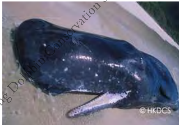
A sperm whale has been found beached in Hong Kong in 2003